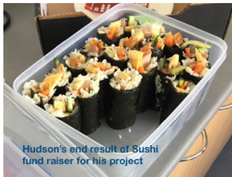
Hudson's end result of Sushi fund raiser for his project

Here are a few snapshots of a few students: